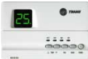
Digital Room Thermostat