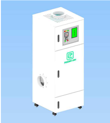
Model : SDC-PL- 4