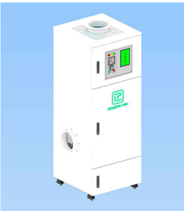
Model : SDC-PL-6