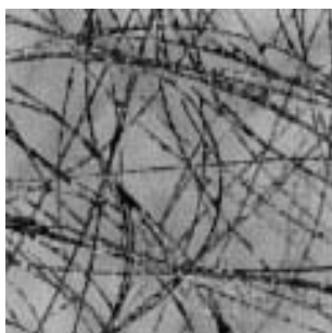
Lightly Loaded Air Entering Side Close-up photo shows open weave pattern that allows over-spray to penetrate deep into the pad.

An entire bank of AG-28 pads can be changed in a few minutes. They fit into standard holding frames, no new grids or other accessories needed. AG-28 pads are directly interchangeable with other types of paint arrestors. Only one AG-28 pad is required per frame, including installations where two paper pads are currently used.