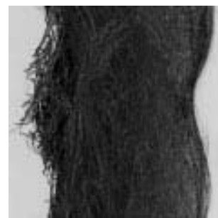
Heavily Loaded Cross Section Cross section view shows how AG-28 pad is completely utilized by collecting paint throughout the full depth.