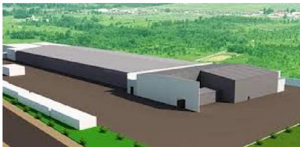
Phase II - P&G Binh Duong Factory, VSIP II