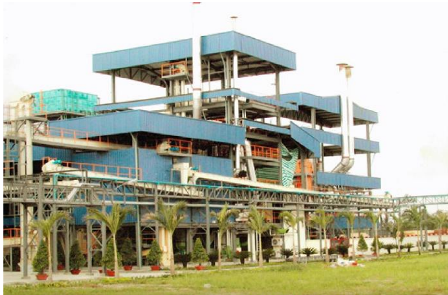
Pgeo edible oild sdn bhd: Cai Lan Oil Factory