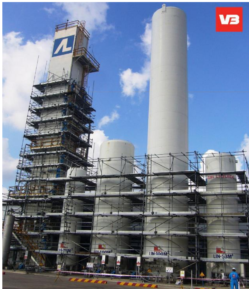
Air Liquide Viet Nam