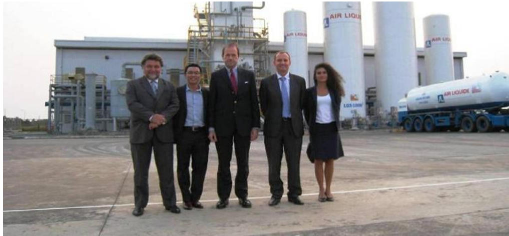
Air Liquide Viet Nam