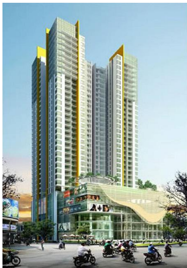
Cinco Plaza (Golden Plaza) Ho Chi Minh City